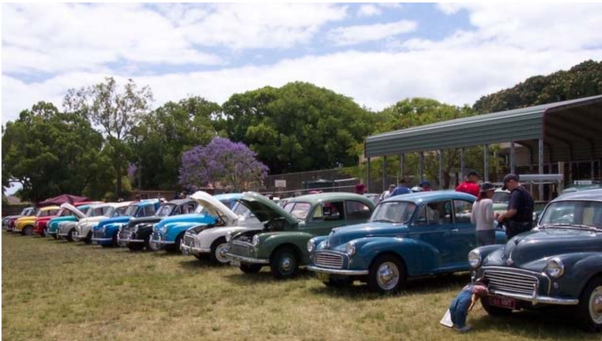
THE BRISBANE SOUTHSIDE CLUB ANNUAL MORRIS MINOR DISPLAY

MORRIS MINOR CAR CLUB OF QLD. INC. HOSTING