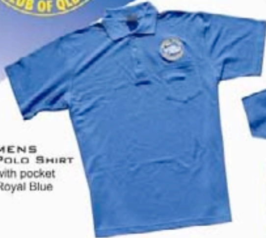
MENS POLO SHIRT with pocket Royal Blue