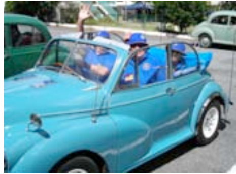
On our way

The run was split into two parts, the first taking us through picturesque bushland settings and onto the southern parts of Moreton Bay and then to our lunch stop at Ormiston.