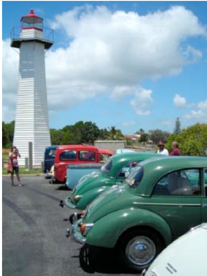
A Minor Lighthouse

MORRIS MINOR CAR CLUB OF QLD. INC. HOSTING