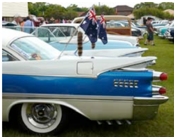
NOT A MORRY but could almost fit one in the boot. Taken at Bayside Restorers Australia Day Rally

NOTE: Please notify Editor if your sale is successful to avoid future enquires.