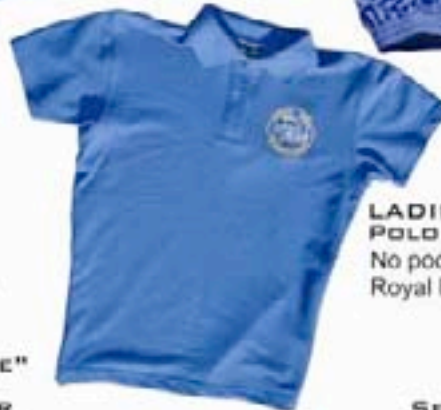
LADIES POLO SHIRT No pocket Royal Blue