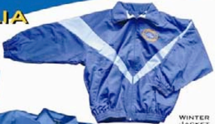
WINTER JACKET High quality with hood internally attached