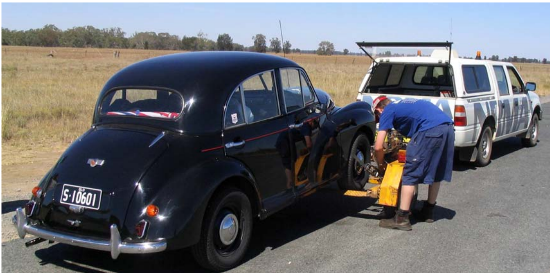
The breakdown at West Wyalong.

The Official Newsletter of the Toowoomba & Downs Morris Group