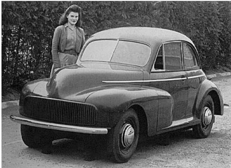
Mock up of the Mosquito