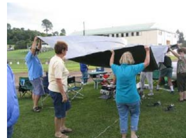
Some under cover work