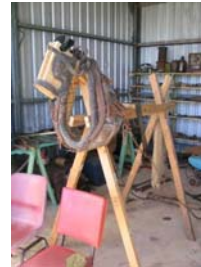
Must be called Morris – No horsepower