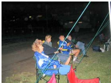
Sitting in the BACK ROW