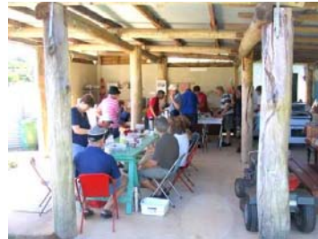
Sunday Morning Tea