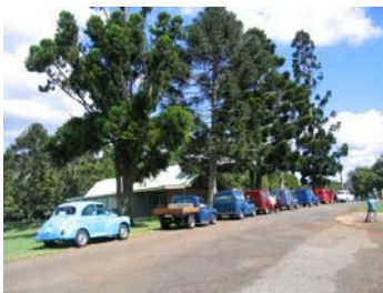
Saturday Afternoon Convoy

( Thanks for the report and roughing it with the rest of us when you could have been snuggled up in your own comfy bed at home 2 minutes up the road. Ed. )