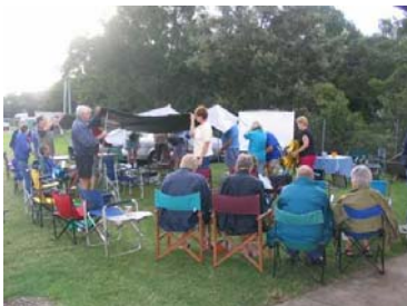
Getting a good seat