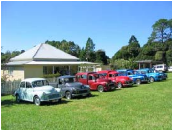
Sunday – Pioneer Cottage